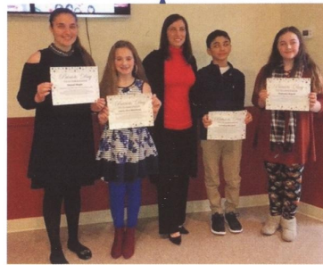
Patriot Youth Ambassadors

WE ENCOURAGE YOU TO CREATE YOUR OWN PATRIOTS' DAY ACTIVITIES SUCH AS: HISTORICAL REENACTMENTS, AWARDS CEREMONIES, PUBLIC FORUMS, ART OR ESSAY CONTESTS AND THEATRICAL PRESENTATIONS.